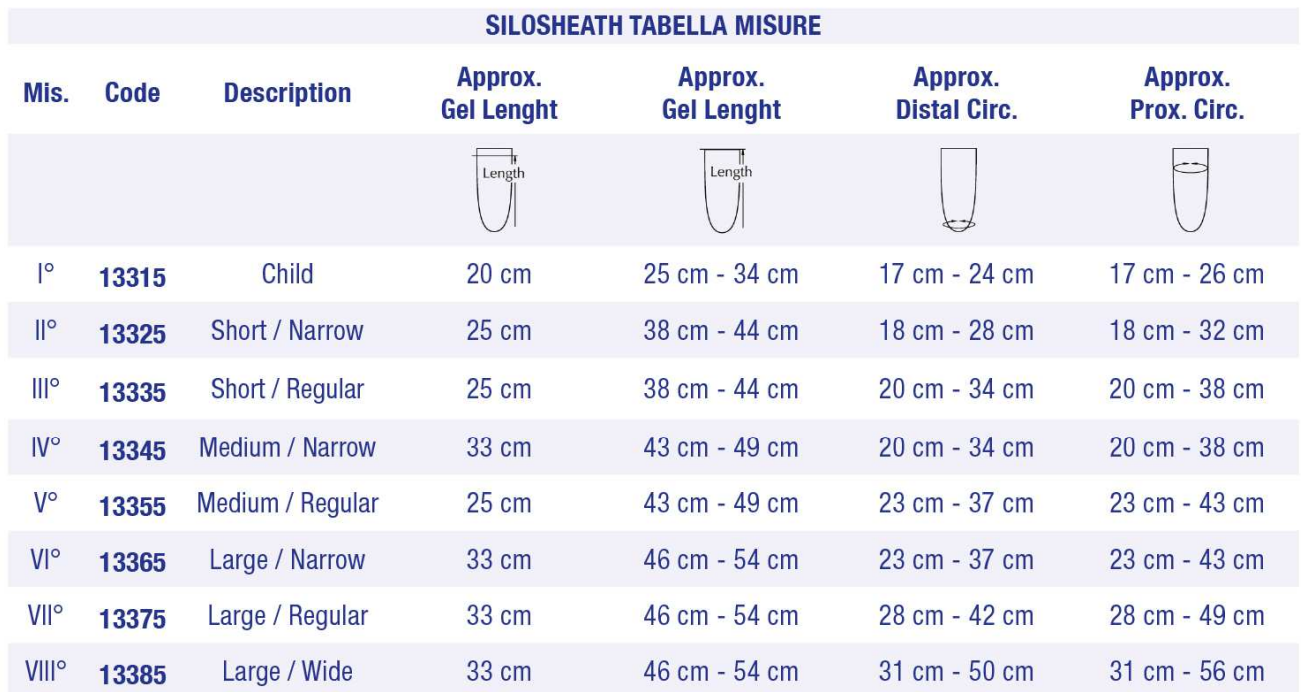
TABELLA MISURE SILOSHEAT